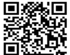
To change E-Mail Address

❖ To change E-Mail Add. :- (ઈ-મેઈલ એડ્રેસ બદલવા માટે.)