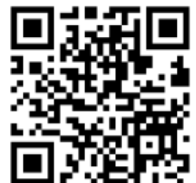
Search & Enroll

❖ Below Link for Duplicate I-Card & Batch Trasfer :- (ડુપ્લીકેટ આઈ-કાર્ડ અને બેચ ટ્રાન્સફર માટે.)