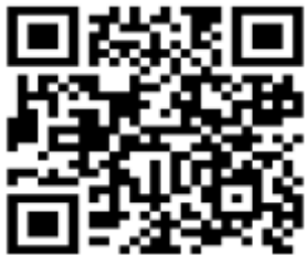
To Resend E-mail Verification

❖ To resend E-mail Verification Link:- (ફરીથી ઈ-મેઈલ વેરીફિકેશન લીંક મેળવવા માટે.)